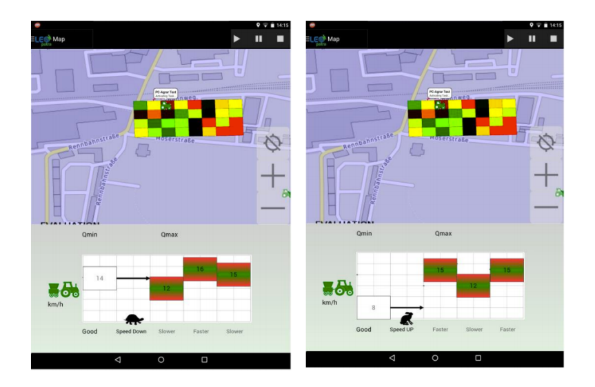
Figure 5: Example of the Speed Predictor (Smart Fertilization Functionality)

tion fields. The ICT solution of Stimulus is based on a multi-mission EO web portal developed within APPS4GMES<sup>12</sup>.